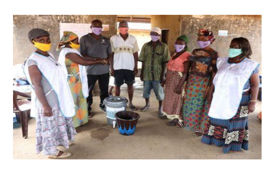
Covid-19 community volunteers