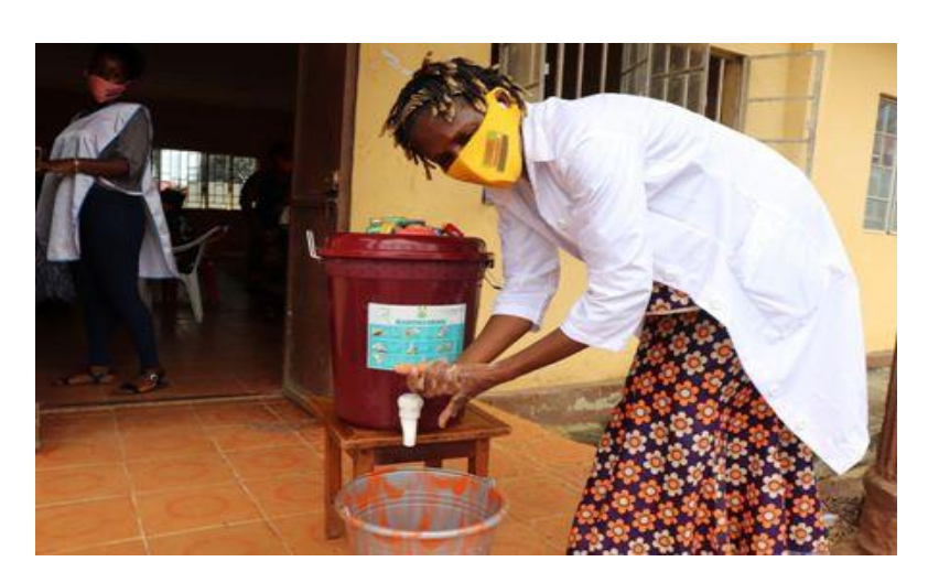
Hand washing demonstration during trainings