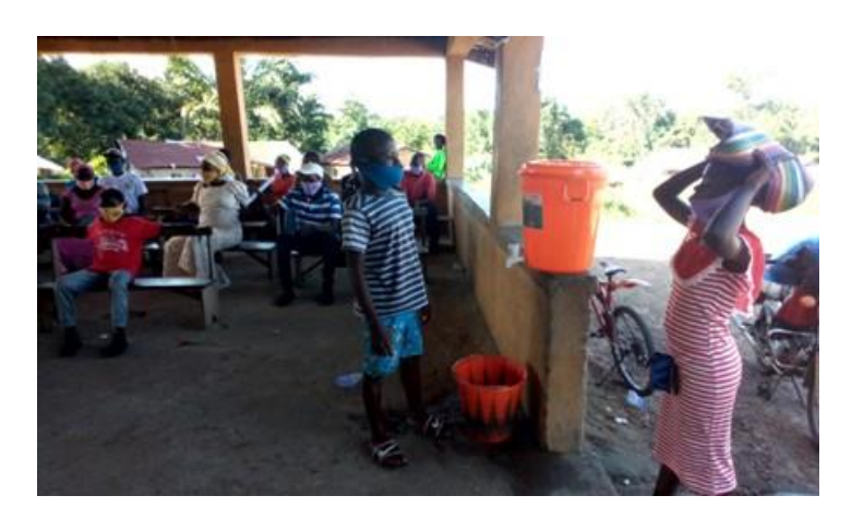
Role plays during trainings