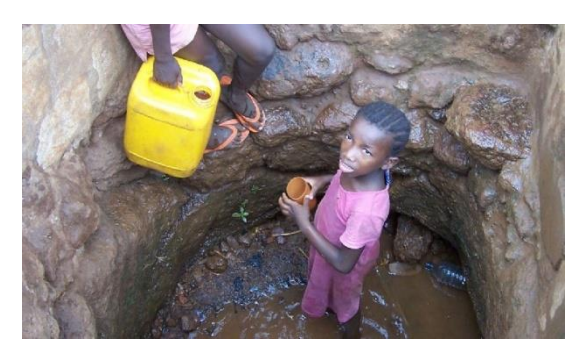
Children sourcing water for domestic use

Sierra Leone's populations face a range of humanitarian challenges, from limited infrastructure for providing safe drinking water or sanitation improvements, to rampant hunger and very high infant mortality rates. The outbreak of Covid-19